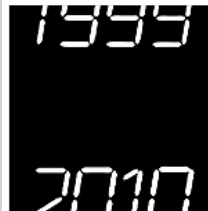
Letters: Y2K and Warming, Real or Not?