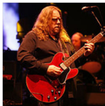
The Beacon Is Booked, So Allmans Will Move