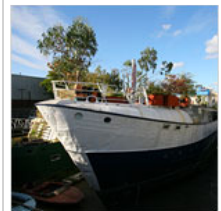
In London, River Views at the Right Price