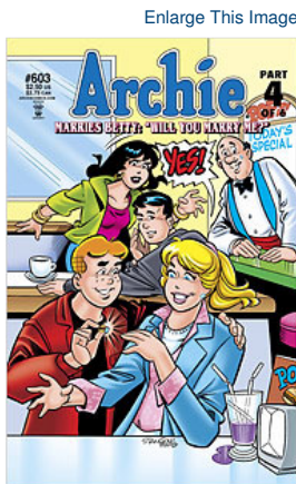
Enlarge This Image